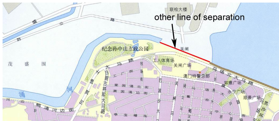
Figure 2: land crossing in north Macau showing placement of other line of separation

This guidance confirms that an "other line of separation" symbol, which is neither an international nor a standard first-order administrative boundary, should also be drawn across the narrow neck of land in the northern tip of the Macau peninsula as shown here in Figure 2.